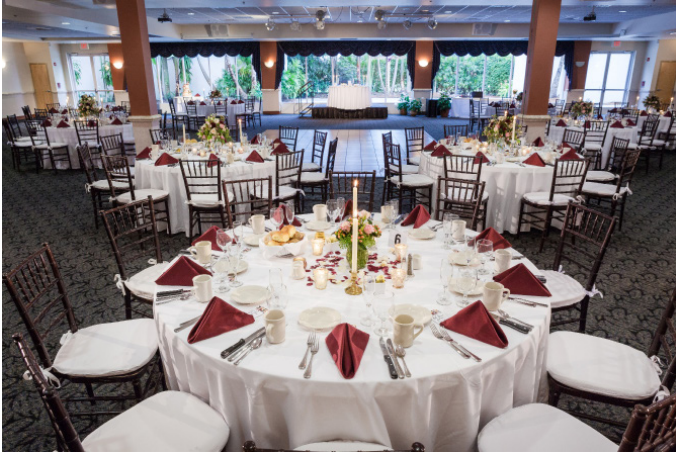
South Banquet Hall