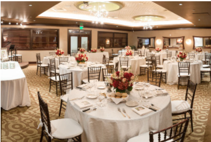
The Grill Back Room